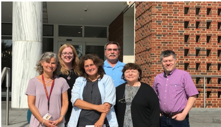
EC members visit Salisbury University for the Fall meeting.

The Department of Politics at Ithaca College invites applications for a tenure-eligible position in Gender and Feminist Politics, with preferred expertise in the subfields of feminist political theory and public policy. While we are open to any geographical area of specialization, we are particularly interested in candidates with a strong research and teaching record in some or any of the following areas: politics, policy and power at the intersection of critical race, class, gender and feminist theorizing, reproductive rights, LGBTQI studies, politics of sexuality, transnational resistance movements, gender-responsive institution building, inclusive development, or related research areas. Deadline Nov. 15.