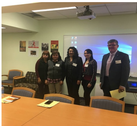
Faculty and students at the end of a panel.