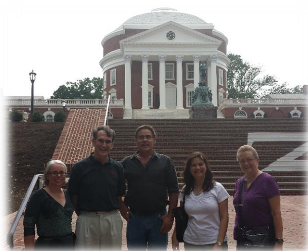
MACLAS Executive Committee members this past September, scouting out the University of Virginia, site of MACLAS 2017.